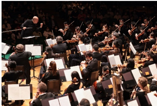
Hong Kong Philharmonic Orchestra