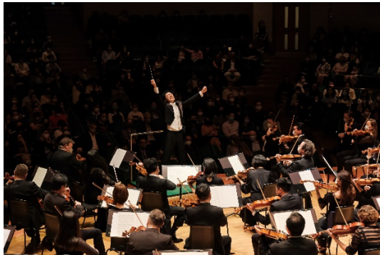
Hong Kong Philharmonic Orchestra