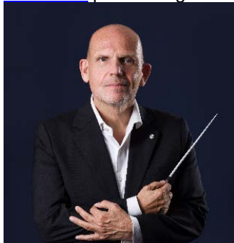
Jaap van Zweden